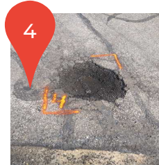
1 Thermal Repairs