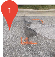
1 Thermal Repairs