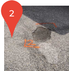
1 Thermal Repairs