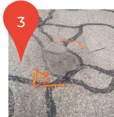
1 Thermal Repairs